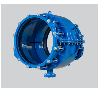
Hydro Stop series 8001/0, PN16 Socket encapsulation collar, DN250-2000